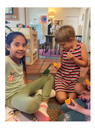
Alpine Montessori is a 501(c)(3) organization. Alpine Montessori admits students of any race, color, national and ethnic origin to all rights, privileges, programs and activities generally accorded or made available to students at school. It does not discriminate on the basis of race, color, national and ethnic origin in administration of its educational policies, admissions policies, scholarship and loan programs and athletic and other school-administered programs.